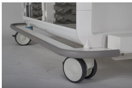
MODU-FLEX bumper for cart of 1x60 cm wide.

MODU-FLEX bumper for cart of 1x60 cm wide – Article no: 129600-00013